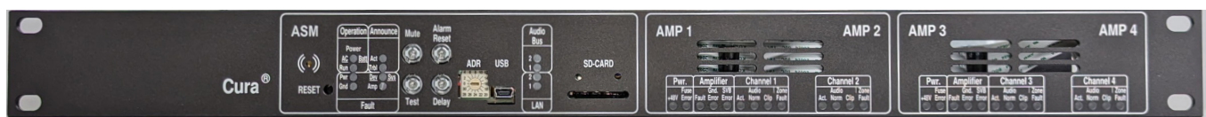
front view CuraG3 (preliminary)

The IP PA System with 4 x 125 W amplifiers and integrated announcement device is a compact and scalable PA system of the 3rd generation Cura® product family. It combines all functions of an announcement device and a public address system in one compact device. A 3rd generation PA system can consist of up to 20 devices that work together and are controlled and monitored by the base device.