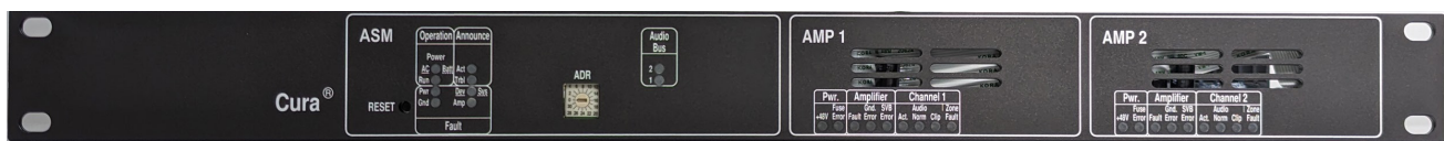
front view CuraG3 expansion device (preliminary)

The expansion unit with 2 x 250 W amplifiers supplements a 3rd generation IP PA system from the Cura® product family with additional power amplifiers and output lines. A 3rd generation PA system can consist of up to 20 devices that work together and are controlled and monitored by the base device.